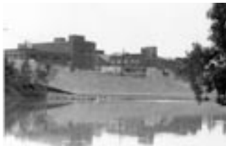
Dow Chemical (MI)